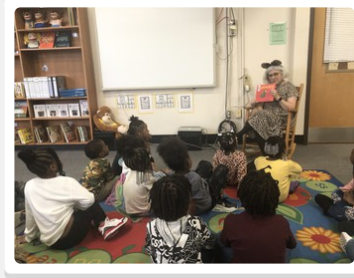
Read Across America