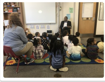
Read Across America