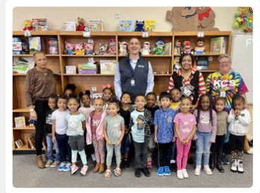
Read Across America