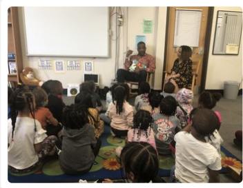
Read Across America