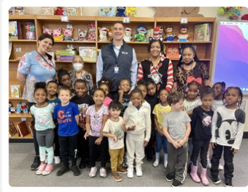
Read Across America